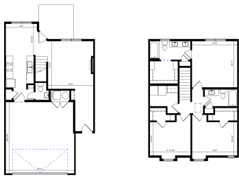
2 1ST FLOOR

The Village at Aspen Ridge Estates | Unit Plans 03 / 22 / 2022