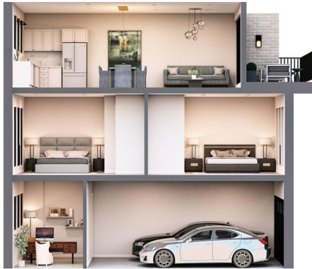
2 BEDROOM, 2.5 BATH