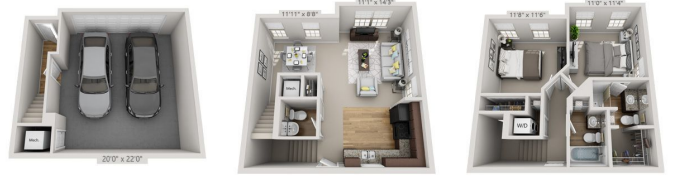
Renderings are an artist's conception and are intended only as a general reference. Features, materials, finishes and layout of subject unit may be different than shown. 3DPlans.com