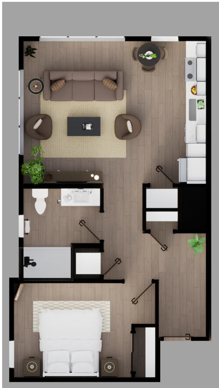
1 BED - TYPE B