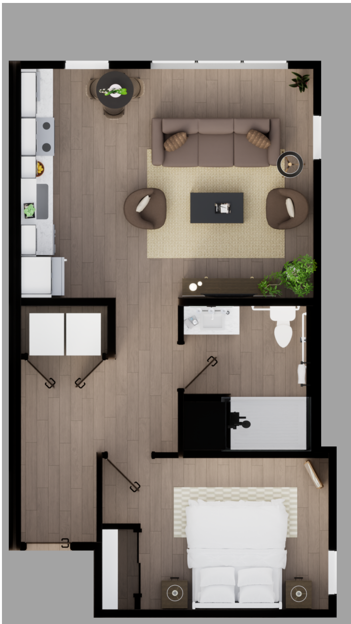
1 BED - TYPE A