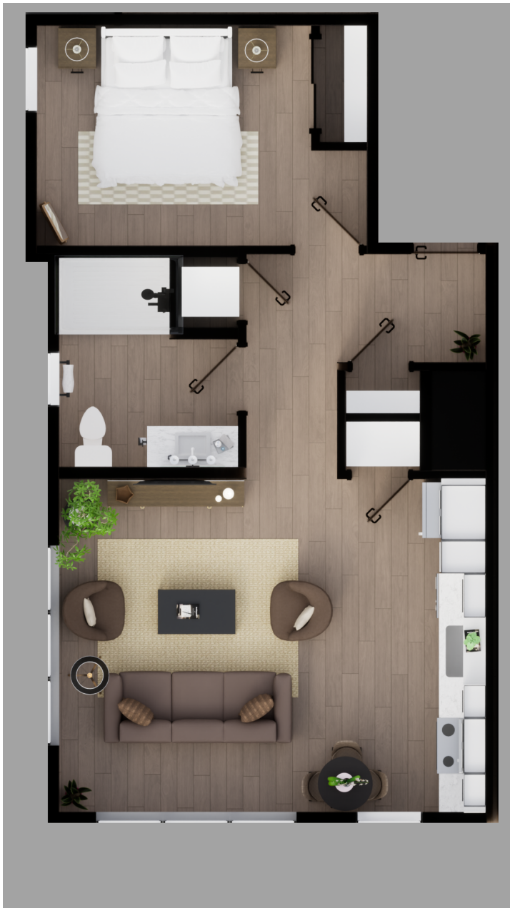
1 BED - TYPE B2